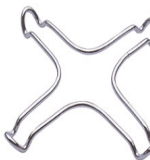
GRM Coffee machine support