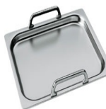
TPK Stainless steel grill plate to cook Teppanyaki dishes